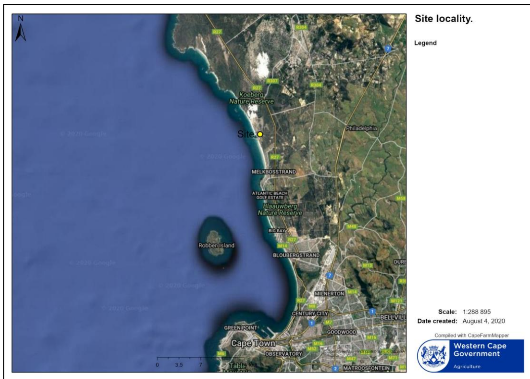
Figure 1: Locality of Koeberg Nuclear Power Station (site).