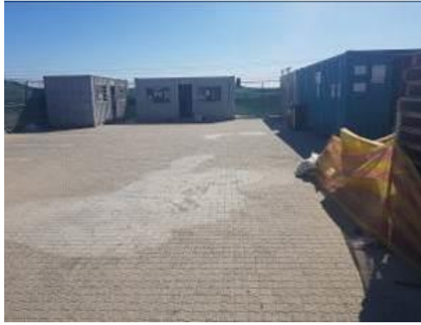
Image 8: Site camp in an orderly state.