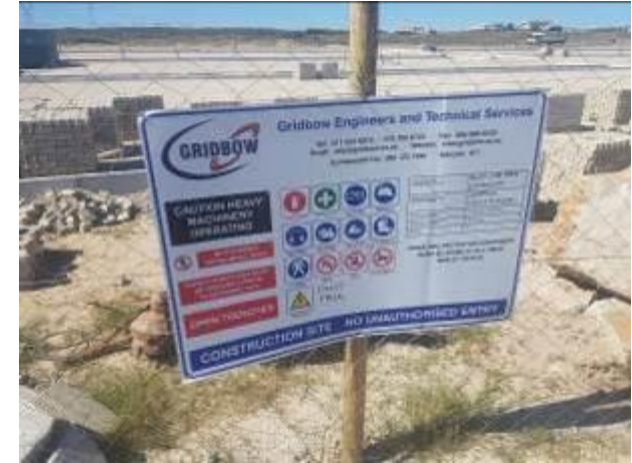
Image 3: Notice board warning individuals of the presence of a construction site.