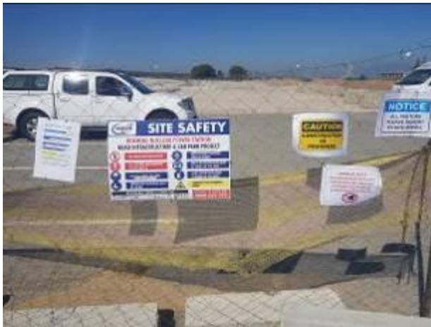
Image 4: Notice boards notifying individuals of the presence of a construction site.